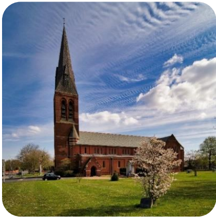
The Cathedral of the Forces, St Michael and St George,

Last year, marked the end of the life and reign of our longest serving monarch. It seemed fitting that the reign of Queen Elizabeth II should be marked in some way in the Cathedral Church of St Michael and St George. The Cathedral underwent some extensive refurbishments last year and reopened in time for the