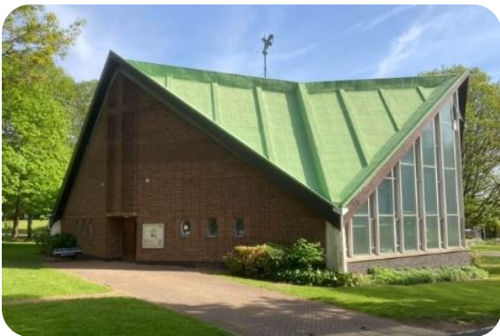
St Nicholas Church, Gamecock Barracks, Bramcote Station