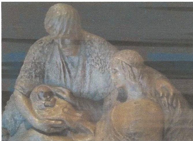
Holy Family sculpture by Josephina de Vasconcellos