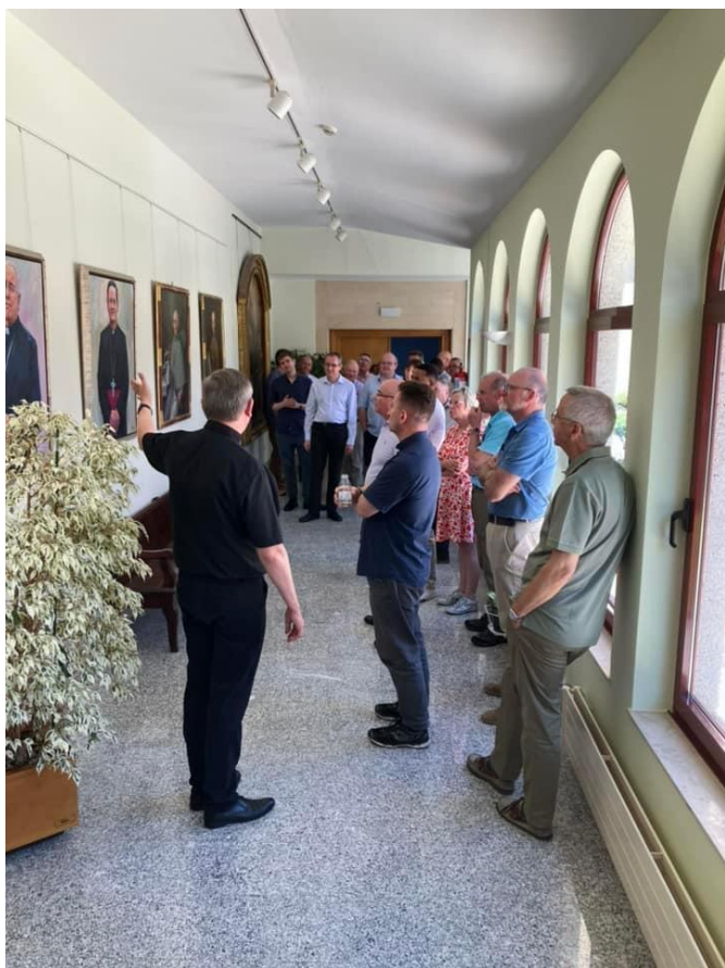
Inside Scot's College, Salamanca