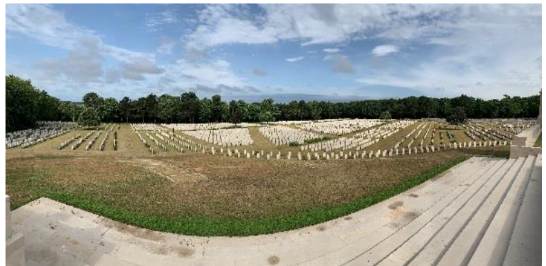
Etaples War Grave Cemetery