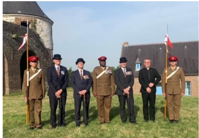
Representatives of The Royal Lancers