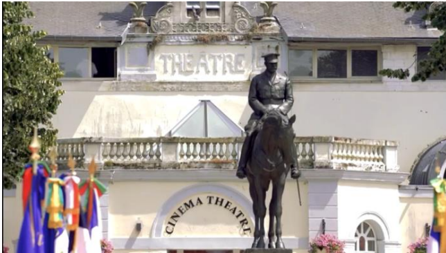
Restored statue of Field Marshall Haig

I am conscious of the huge privilege that is afforded to us as Army Chaplains in being able to provide spiritual support, pastoral care, and moral guidance to those in our care each day. However, we are also given a unique stage to conduct remembrance and commemoration services where we are ambassadors for the Church and we are provided with the opportunity to 'go to the ends of the earth to spread the Good News.'