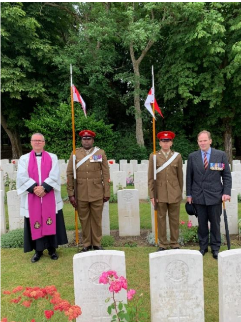
Service at Etaples