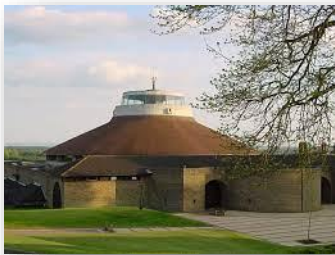
Worth Abbey, West Sussex 3 - 6 Oct 22

For further information see: DIN 2022DIN01-013