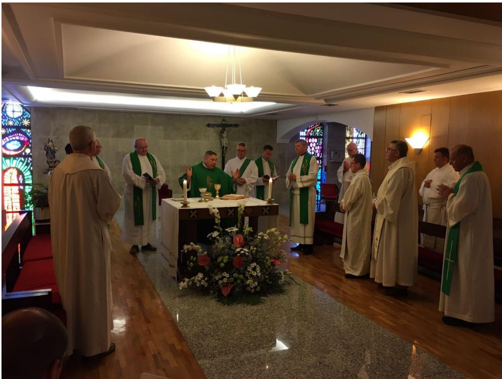
Army led Mass at the Scot's College, Salamanca