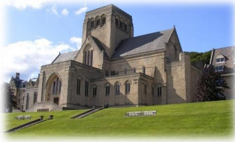
AMPLEFORTH ABBEY 30 OCT - 2 NOV 23

The last retreat for 2023 is at Ampleforth Abbey in North Yorkshire. This retreat location is a Benedictine Abbey. Those attending the retreat will gain insight into Benedictine spirituality which is centred on the core values of silence, prayer, obedience, stewardship, listening, humility, peace, work, living in community and hospitality. Through led sessions, periods for prayer and reflection, and with the opportunity to join with the monastic community in the Abbey Church in praying the Daily Office, retreat participants will be refreshed and reinvigorated in the exploration and renewal of their faith.